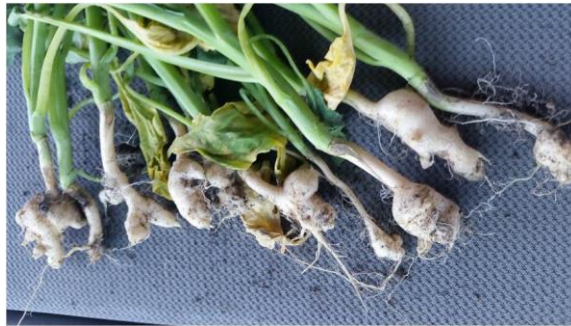
Figure 1. The first case of a clubroot infection found in Ontario canola in 2016

In the summer of 2016, clubroot disease was found throughout a field of canola in West Nipissing. Clubroot has been established in Brassica vegetable crops in Ontario for a number of years, but this was the first time the disease was confirmed in Ontario canola. A soil survey was conducted in 2016 and 2017 across the canola growing regions of the province, and clubbed roots were collected from infested canola fields. The purpose of this preliminary survey was to determine the current distribution of clubroot across canola growing regions of Ontario and to determine the pathotype (strain) present in each clubroot-positive field.